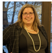
Facilitated by Heather Weber

Building Ramps to Success: Exploring Universal Design for Learning and Differentiated Instruction in the Classroom